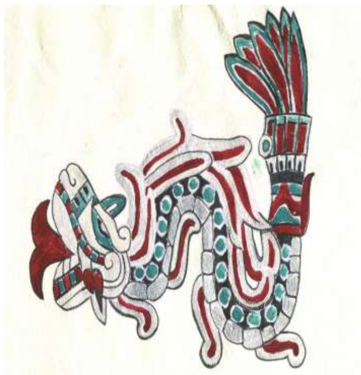
Quetzalcoatl as the Plumed Serpent

Overall, this 26 year period provides an opportunity for planetary healing and awakening. How the people of the world handle it will be of extreme importance if we wish to move positively into a new world cycle. The Harmonic Convergence is the dance of duality, of light and dark, male and female, enlightenment and ignorance. I am sure that it will test humanity for the strength of our spiritual resolve. It marks a period of initiation for planetary consciousness... and potentially the birth into the 6th Sun of the Aztec prophecy; Sun of Flowers, Xochitl Tonatiuh; and the 5th WORLD of Mayan and Hopi cosmology. It potentially ushers in the return of CHRIST / QUETZALCOATL and our relatives from the stars.