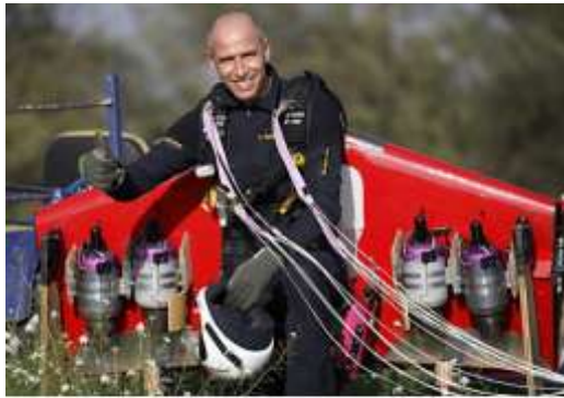
Human Flight... Yves Rossi

During the rest of the meditation effortless crown chakra energies kept flooding my being. "Thank you." "I love you."