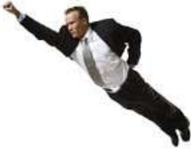
Flying Christ Modern Rendition

©2008 All Rights Reserved. This article contains clickable picture captions & other links you are invited to follow.