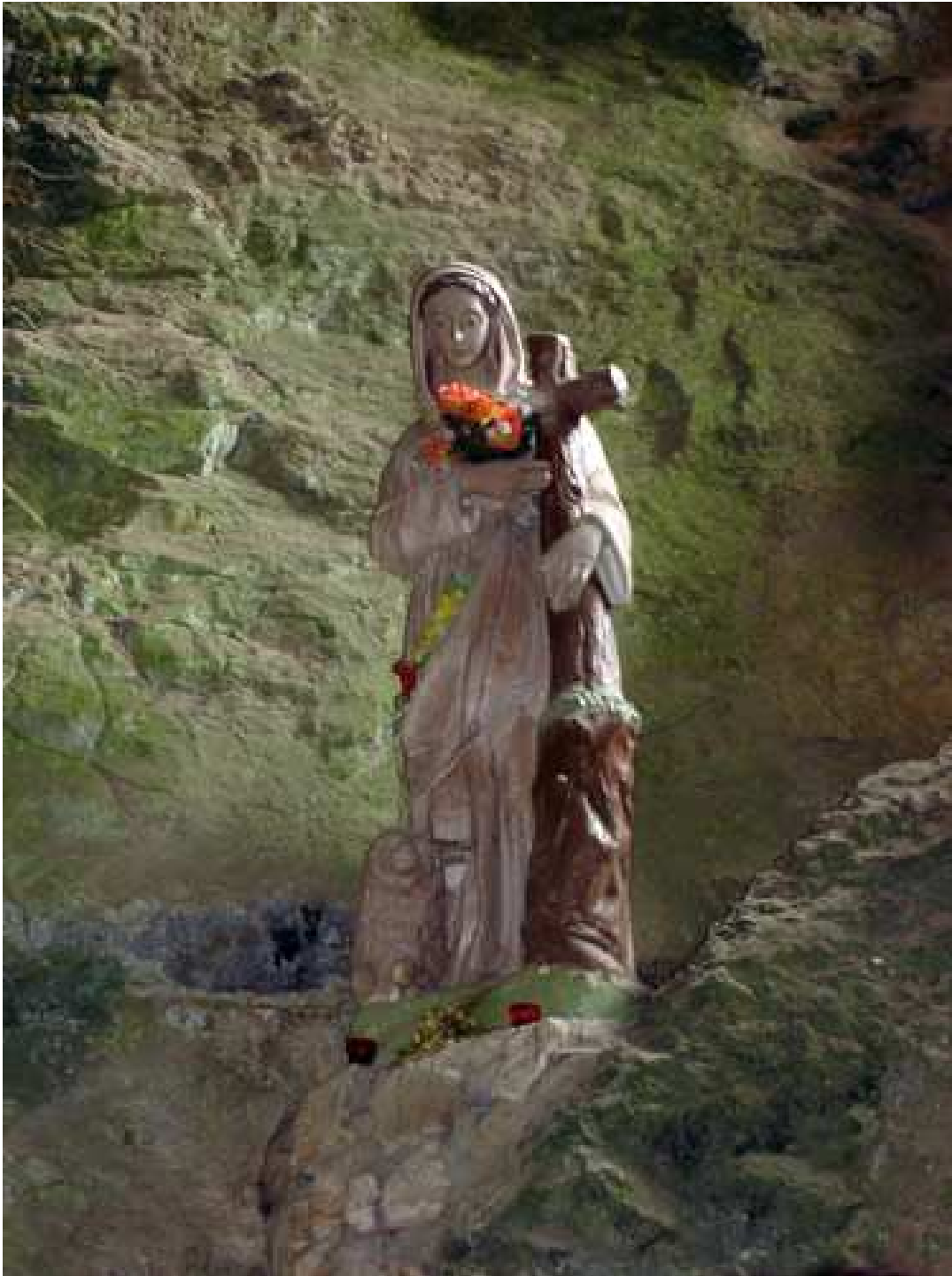
Mary Magdalene in Gorge de Galamus, Languedoc France

We can develop this project through various websites, e-mails, promotional materials, and by word of mouth. Please contact me at chalice4444@yahoo.com to find out how.