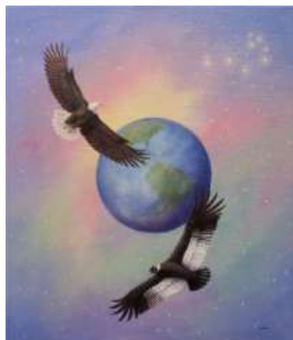
Painting by Monique Monos ©2002

With this knowing anchored at the deepest energetic level, we begin to create a safe and sacred world for all.