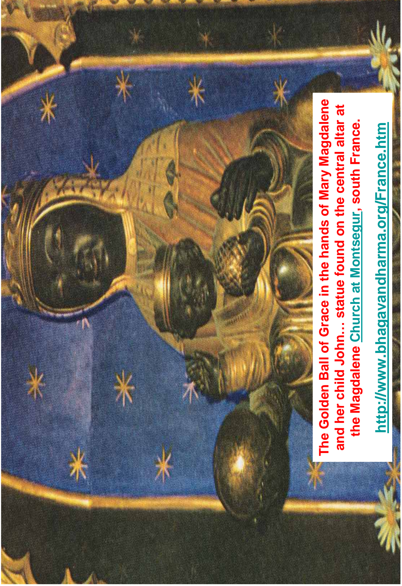
The Golden Ball of Grace in the hands of Mary Magdalene and her child John... statue found on the central altar at the Magdalene Church at Montsegur, south France. http://www.bhagavandharma.org/France.htm