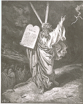
Moses (Zipporah not shown)