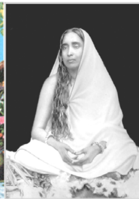
Sarada Devi (Ramakrishna not shown)