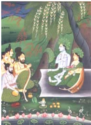
Sita and Rama