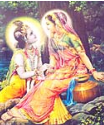
Radha and Krishna