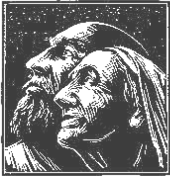
Abraham and Sarah