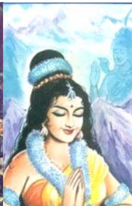
Parvati (Shiva not shown)