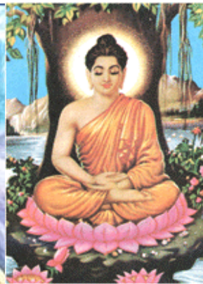
Buddha (Yashodhara not shown)