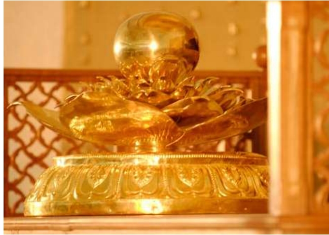
The Golden Ball of Light at the Oneness Temple in Golden City south India