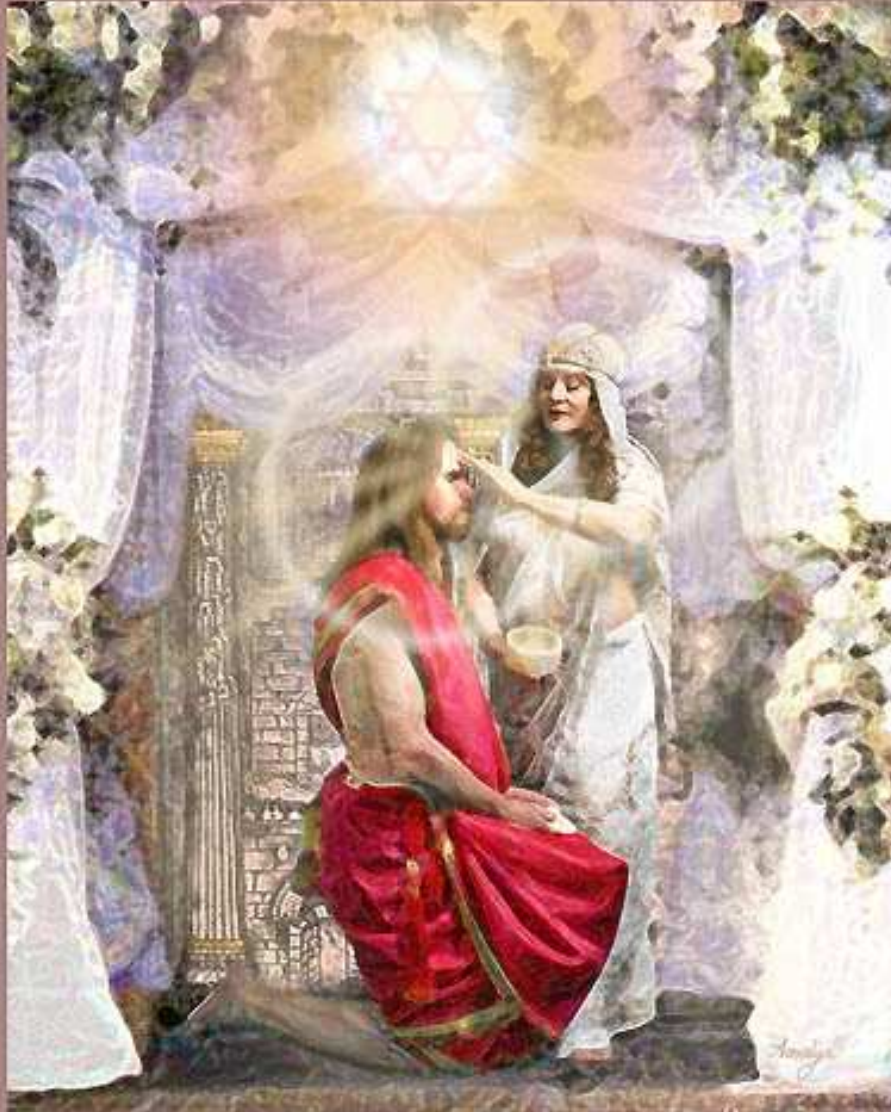
"The Magdalene and The Christ"

Digital photo montage (c) by Amalya 7-4-06