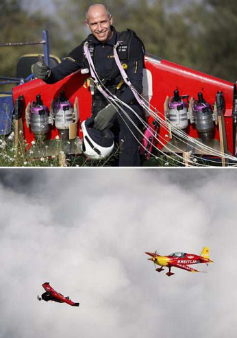
World's first flying man Yves Rossi